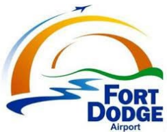
Fort Dodge Regional Airport