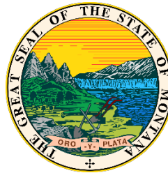
Montana EAS Task Force