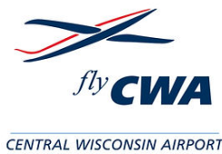
Central Wisconsin Airport