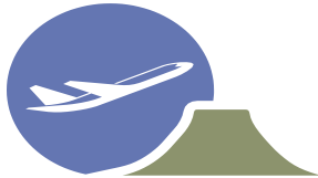
Northeast Wyoming Regional Airport