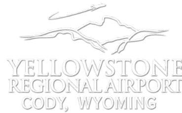
Yellowstone Regional Airport