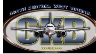
North Central West Virginia Airport