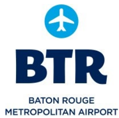
Baton Rouge Metropolitan Airport