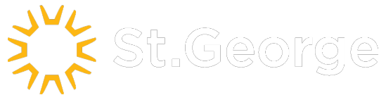
St. George Regional Airport