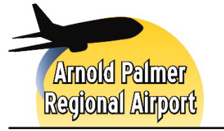
Arnold Palmer Regional Airport