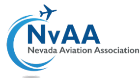
Nevada Aviation Association