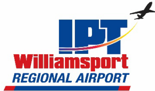
Williamsport Regional Airport