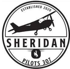
Sheridan Pilots 307