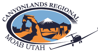
Canyonlands Regional Airport